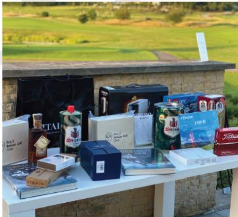
Tombola o hodnotné ceny